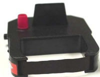
T-4U Cassette Ribbon