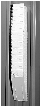
Time Card Rack